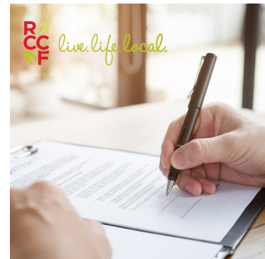
7 new funds started (as of 12/13)