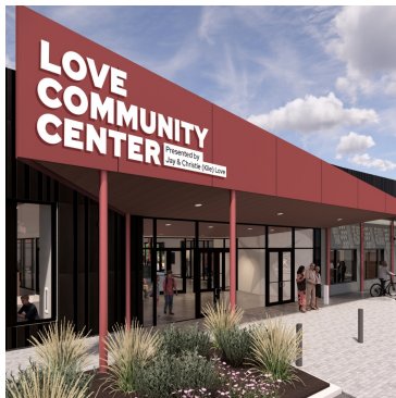
3 grants to support the LCC