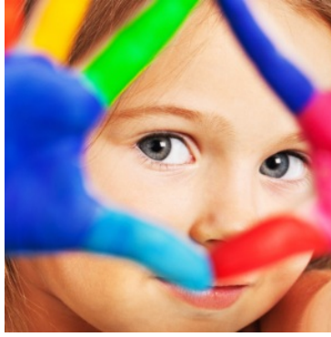
Childcare Provider Selected for the LCC