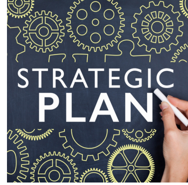
Our New Strategic Plan is Underway