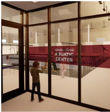
Introducing the Herdrich Family Aquatic Center

Here are the top stories from last month.