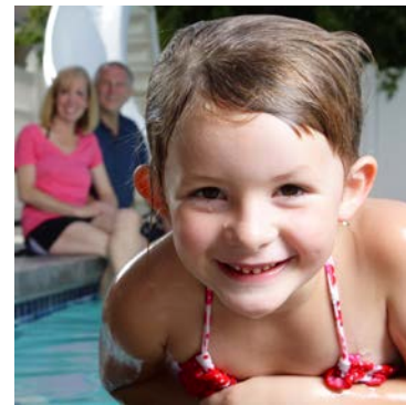
Get Peace of Mind: Write Your Will for Free