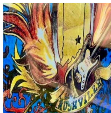
Grantee Update: The Heart of Rushville