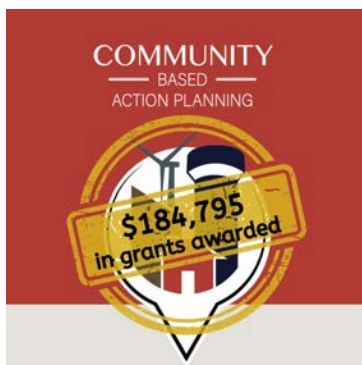
That's a Wrap for CBAP Grants

Here are the top stories from last month.