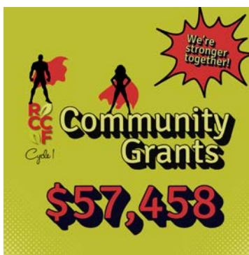
Cycle I Grants Announced