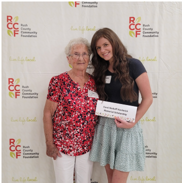
Scholarship celebration & recipients photos

Here are the top stories from last month.