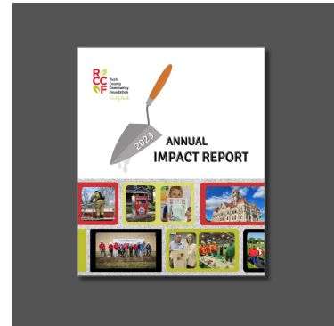
Read your 2023 Annual Impact Report