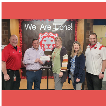
Legacy Gift to Benefit RES

Here are the top stories from last month.