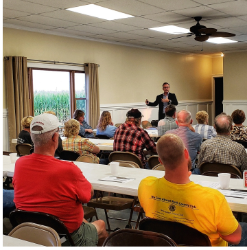
GIFT VIII Planning Grants