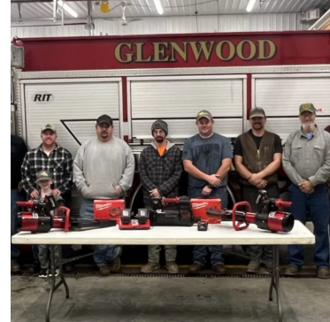
Grantee Update: Glenwood VFD