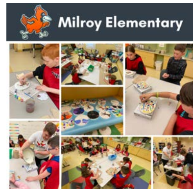
Grantee Update: Milroy Elementary