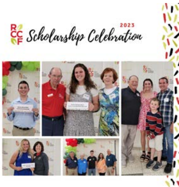
Scholarship Celebration Recap

Here are the top stories from last month.