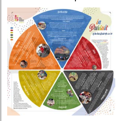
Your Annual Impact Report is Out

Here are the top stories from last month.