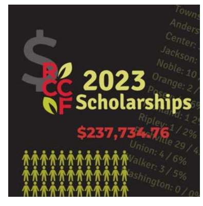
Scholarship Season By the Numbers