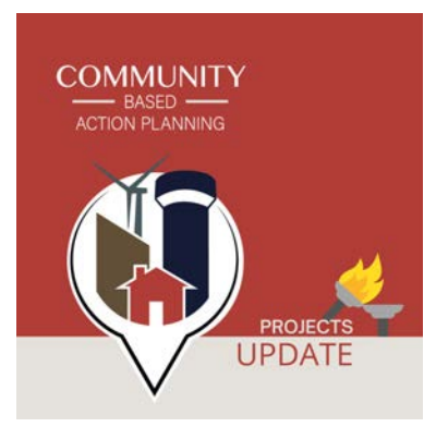
CBAP Projects Update: Passing the Torch