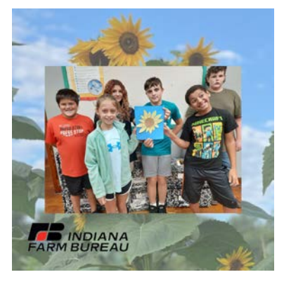
Grantee Update: Rush County Farm Bureau