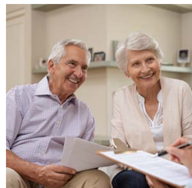
QCDs: Tax Benefits