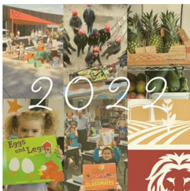
Look Back at the

Here are the top stories from last month.