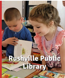
Rushville Public Library

"1,000 Books Before Kindergarten" update: 223 children signed up. More than 400 books distributed and 19,000 books read.