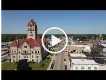
Should we expand our trails, incorporate more art, increase services? Or something else?