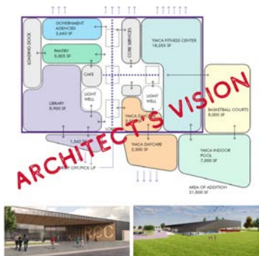
Behind the Scenes REC Center Update

Here are the top stories from last month.