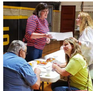
Get Involved with CBAP