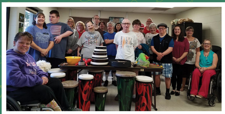
Shares, Inc. Participants enjoying Music Therapy and musical instruments provided by the Rush County Community Foundation.