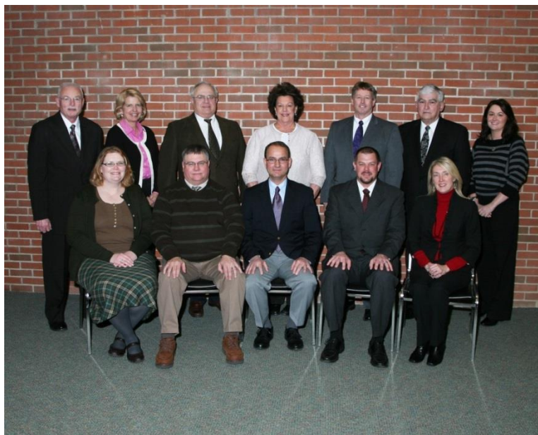
2013 Board of Directors

The Board of Directors determines the Foundation's policies and provides oversight to its operation.